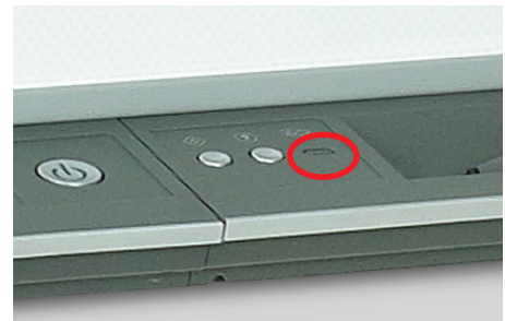
Ready Light on pen tray of 800 series board

NOTE: After you turn on your computer, the Ready light is red while the SMART Board interactive whiteboard and the computer establish communication.